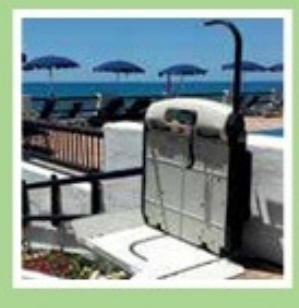
A wide range of products dedicated to people: home lifts and elevators, chairlifts and stair-lifts, platform lifts and mobile stair climbers.